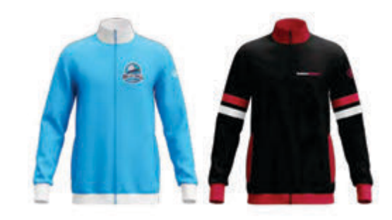
W/M FULL-ZIP JACKET

FEATURES: This full-zip jacket combines custom design options with functional pockets, offering warmth and style for any occasion.